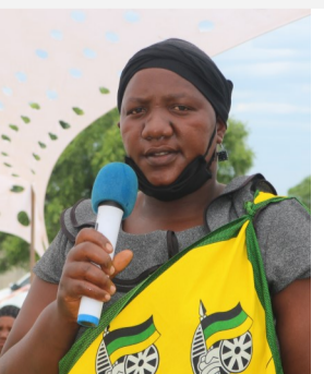
Community members lined up to ask the mayor questions ranging from water to streets, education and houses during the Imbizo at Rikhotso Village.