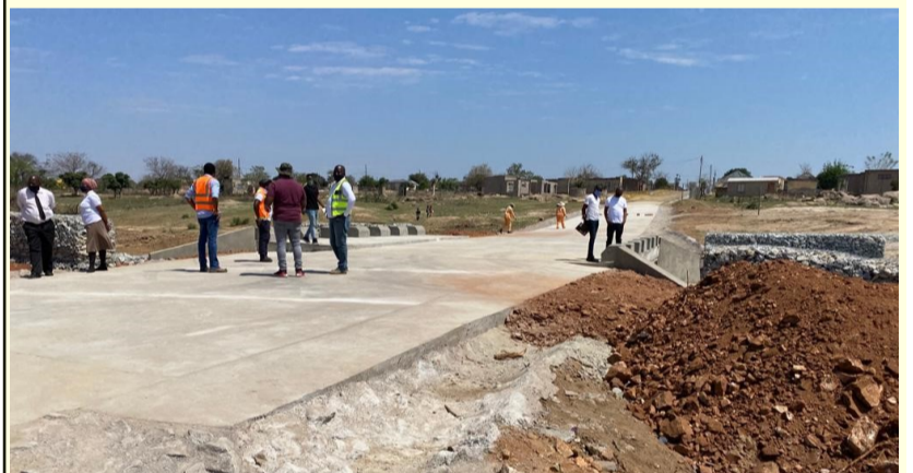
Mawa Low-level bridge was completed in 2020 and connects Mawa Block

There is also the Kgwekgwe low-level bridge and Mokonyane Low-Level Bridge.