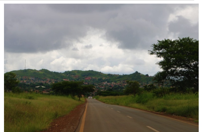
This road connects Lenyenye and Khujwana as well as other nearby villages