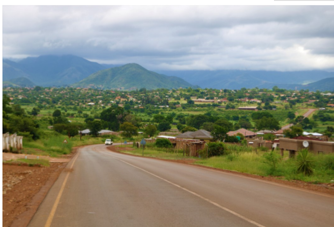
Tickeyline, Myakayaka, Burgersdorp, Gavaza to Mafarana road