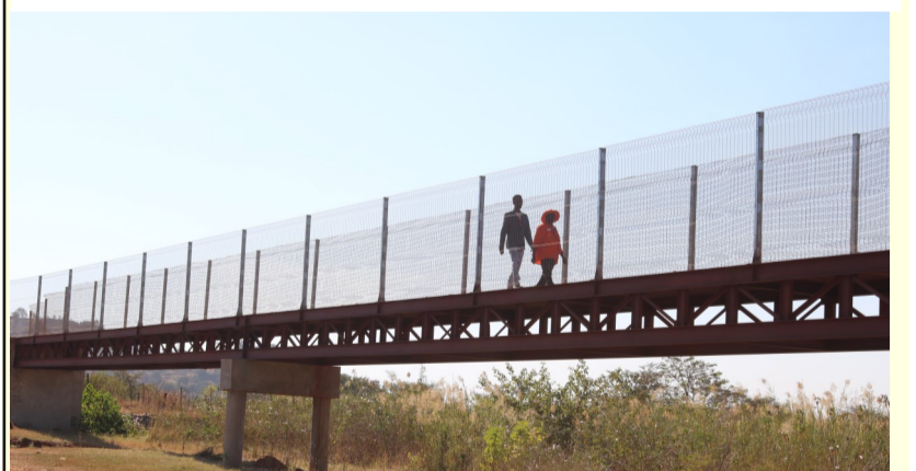
This low-level bridge connect Marumofase to Nabane