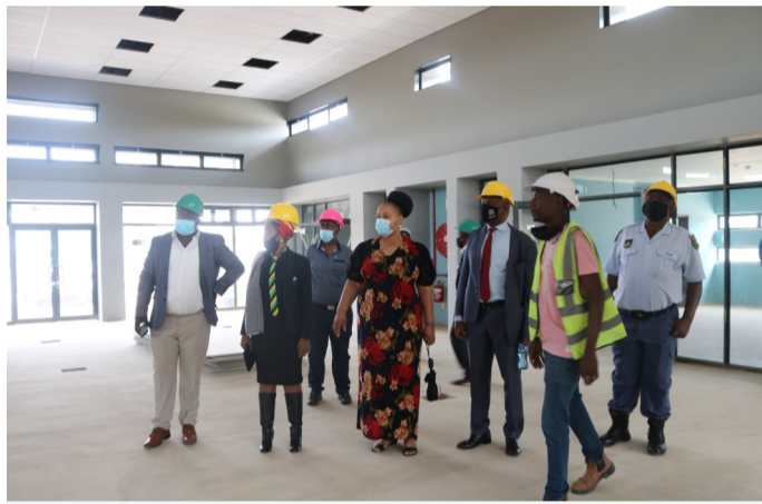
Mayor and his delegation on a guided tour of the newly built library at Runnymede