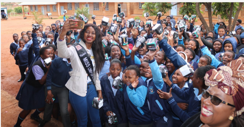
GTM First Lady, also has a sanitary towel distribution campaigns which has donated over 20 000 sanitary pads. She has also identified schools that she donates sanitary towels on a monthly basis.