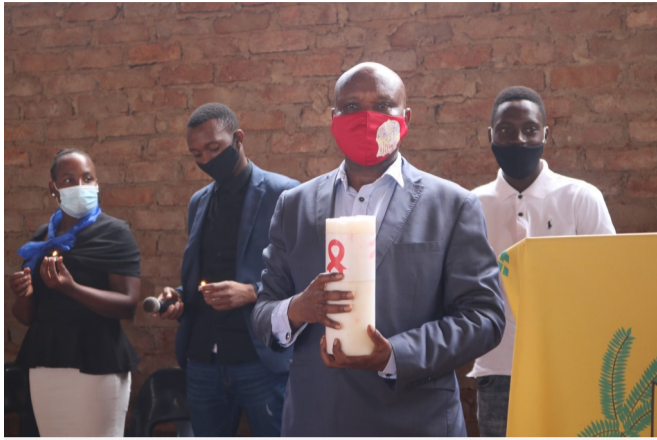
Mayor Maripe Mangena leading the candle lighting session during the AIDS Day commemoration at Ntsako Village