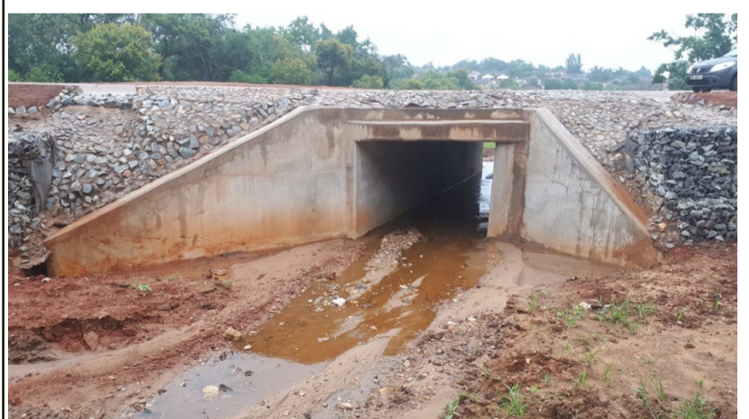
Agatha low-level bridge