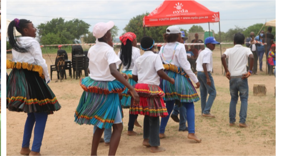
Youth from Rikhotso entertain the audience during the Imbizo