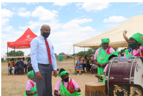
Mayor interacts with traditional dancers