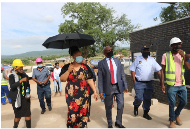
Mayor and Speaker arrive at Runnymede Library for an inspection