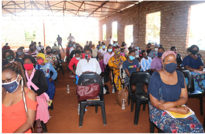
Congregants and guests during the AIDS Day commemoration at Ntsako Village