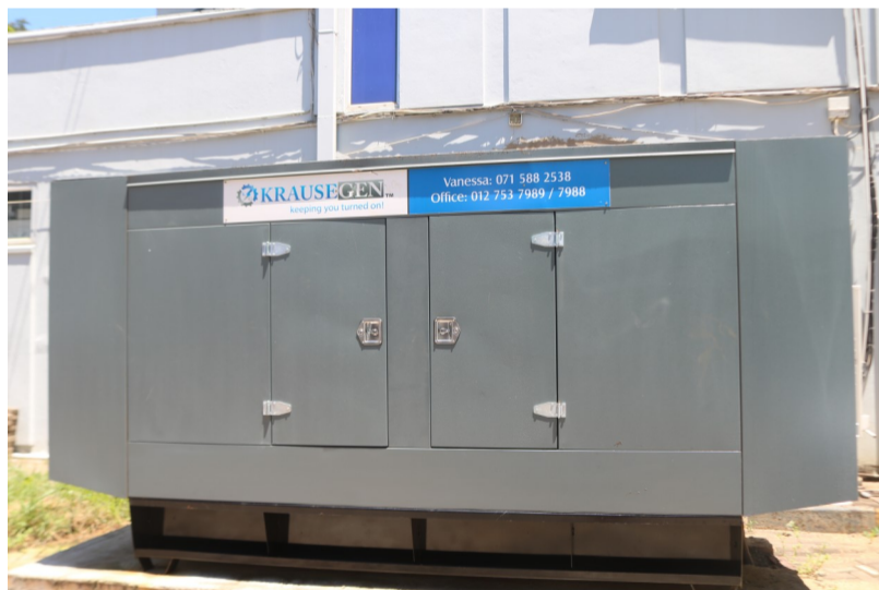
The 300kv generator at Greater Tzaneen Municipality offices in Tzaneen

It was not only services at the civic centre that were disrupted by power outages, but water services also suffered a