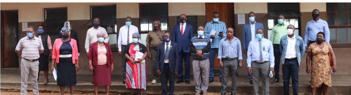
Mayor Maripe Mangena with councillors, traditional leadership, members of the School Governing Body and Educators at Vallambrosa Primary School at Mokhwathi Village on 15 February 2021

On 15 February 2021 public schools reopen for the 2021 academic in the middle of the coronavirus pandemic that has destabilized all aspects of life, including teaching and learning. As schools reopen their door, the Greater Tzaneen Municipality spread its councillors across the various schools to monitor Covid_19 health protocols compliance. Councillors were dispatched to 35 schools on the first day of school. Mayor Maripe Mangena visited Vallambrosa Primary School in Mokhwathi Village to "support and monitor". Mangena said "the purpose of the visit is support, monitor, and check if everything is fine as children return to school".