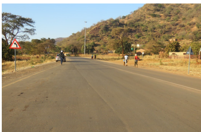
Rita to Mariveni road upgrading project did not run its full course due to threats and protests from some residents of Zanghoma Village.