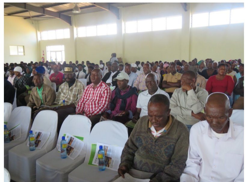
The Runnymede Sports Centre Hall hosted the 2019 State of the Municipal Address

The Greater Tzaneen Municipality also has the Nkowankowa Stadium and Lenyenye Stadium. Lenyenye stadium was revamped a few years ago at a cost of R14 million rand. Nkowankowa stadium is the only stadium with a synthetic athletic track in Mopani