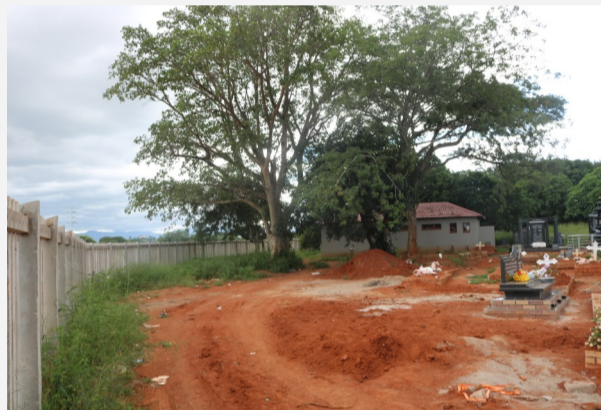
Nkowankowa Cemetery has a new palisade fence and a paved entry