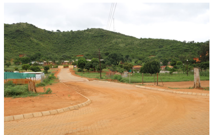
Nelson Ramodike High Access Paving road project which connect Lenyenye to Marumofase and Nabane covers 4.8km.