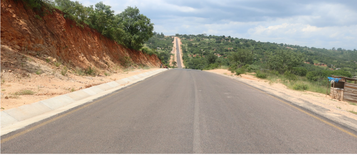
Morutji to Kheshokole road project was completed in early 2020. The project which covers 11 kilometres costs over R100 million.

Infrastructure development a key that can unlock economic growth and general development. Without proper reliable infrastructure investors seldom consider setting up businesses as it's normally costly to do business in the absence of infrastructures such as roads, water, and electricity. The Greater Tzaneen Municipality has in the past decade engaged in rapid rolled out of infrastructure through the financial injection of the Municipal Infrastructure Grant (MIG). The past 10 years have seen an acceleration in the upgrading of critical roads across the municipality, however, in this edition, our focus will be on the projects implemented in the past 5 years.