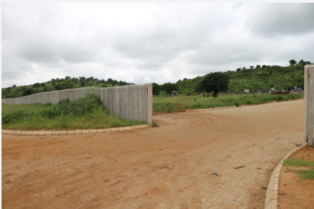
The 50 hectare Lenyenye Cemetery has a new palisade fence and a paved entry

The old ablution facilities in Nkowankowa have been revamped after they were vandalized. The entrance to Lenyenye Cemeteries has also been paved with bricks and ventilated pit latrines have been built inside the cemetery. The Nkowankowa cemetery has been extended by 20 hectares after the old cemetery reached its capacity. The original site of the Lenyenye Cemetery also reached its capacity, and the new cemetery was built less than 5km away. There is also a new tar road from Lenyenye to the cemetery and through to Khujwana Village.