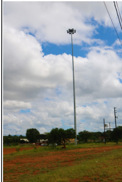
Apollo lights like this one at Muhlava Village have been installed in all traditional authorities offices in the GTM.

not solely meant to deter criminals. With strategic lights, residents are likely to come out at night and a small profitable economy might spring out. In Dan, Village crime was the key motivator behind the municipality's move to install Apollo lights. The two spots where the Apollo lights will be installed were identified as crime Hotspots. They were also said to be a place where there is a "hive of activity".