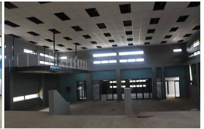
View inside the state of art Runnymede Library