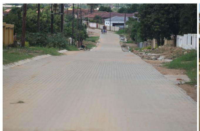
Codesa to Hani street project in Nkowankowa was halted after contractual dispute between the GTM and the contractor