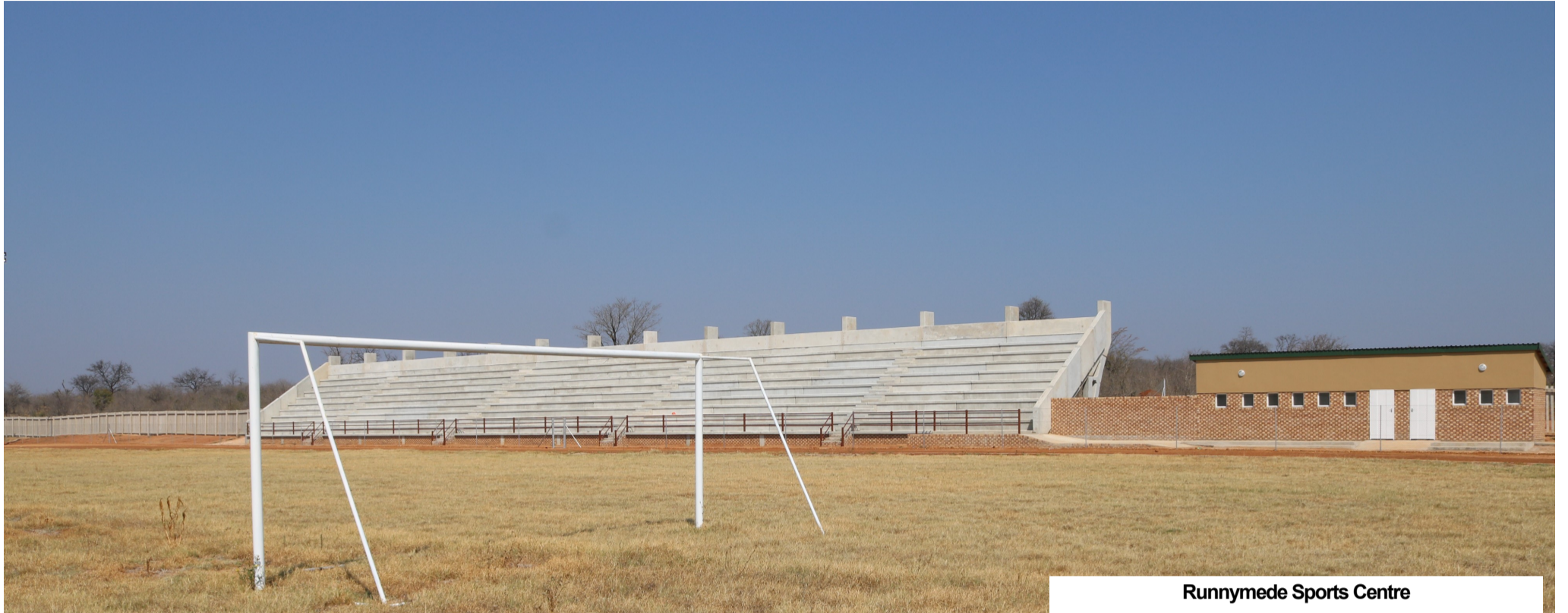
Runnymede Sports Centre

Proper sporting facilities have always been reserved for the townships, cities, and suburbs. Those living in rural communities had to settle for dusty sports fields with no hope of getting proper facilities. Although much has not changed, there is some progress albeit minimal. With competing needs and resource limitations, the Greater Tzaneen Municipality must balance the need for roads, bridges, and sports facilities. In the past five years, the municipality has built a new sports centre and upgrade two others.