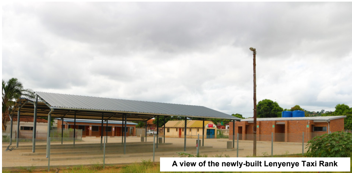
A view of the newly-built Lenyenye Taxi Rank

A sod-turning for the construction of Lenyenye Taxi Rank was turned into spectacle when protesters burnt tyres and prevented the sod turning from proceeding, but that is now ancient history. The taxi rank has been completed and the residents are happy with their new facility. Lenyenye which is one of the only two townships in the Greater Tzaneen Municipality will for the first time in its history have its own taxi rank. The boasts five hawkers stalls, holding and loading