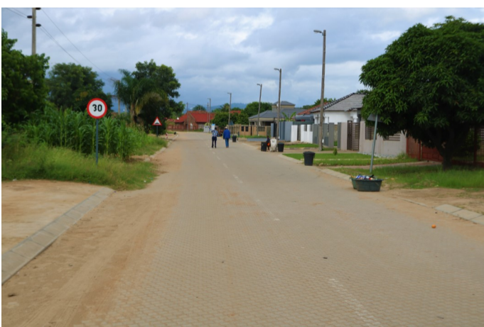
Nkowankowa Section D Street paving

nicipality demanded that the contracts be declared unlawful and be set aside. The court granted an order setting aside both Mulati and Codesa projects contracts. The projects have since resumed under new contracts and new service providers. In both cases, the Bill of quantities (BOQ) differed significantly from the tender amount. If they were not set aside, both the Mulati and Codesa projects would have cost the municipality twice the tendered amounts. Tender disputes delay service delivery and deny communities much-needed infrastructure and services. They often take long, an example in the Sasekani to Nkowankowa project which was litigated and took more than two years to be resolved by the courts.